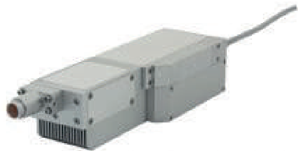
*Luce 532nm laser head