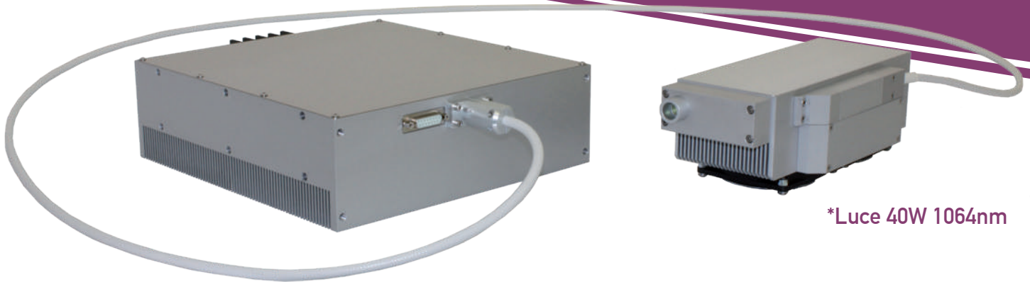
*Luce 40W 1064nm

Luce family comprises innovative air-cooled CW DPSS Q-switched lasers aimed at the micromachining industrial applications.