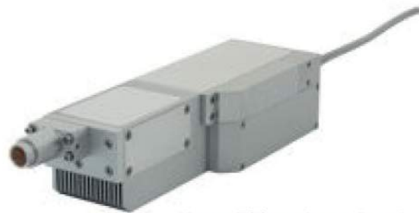
*Luce 532nm laser head