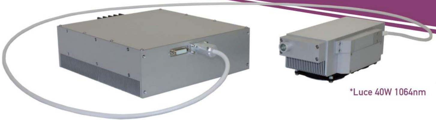
*Luce 40W 1064nm

Luce family comprises innovative air-cooled CW DPSS Q-switched lasers aimed at the micromachining industrial applications.